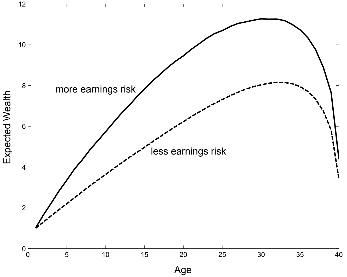
Figure 1: Expected Wealth Profiles